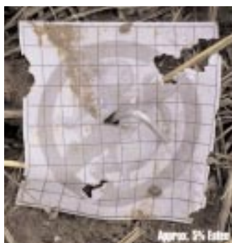
Beware! Mouse problem emerging. Consider baiting