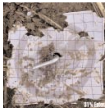
Treat immediately if crop is at vulnerable stage