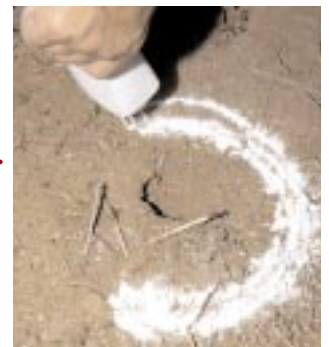
Applying talc to a hole