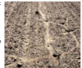
A mouse hole with active runways