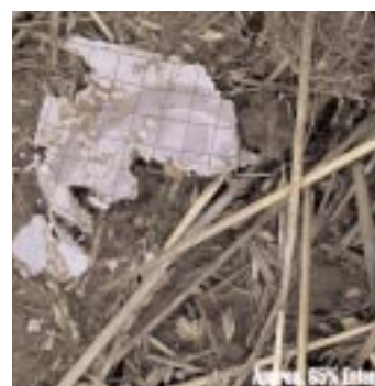
You have a major problem & the crop is being damaged.