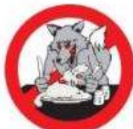
FOXOFF® Fox Bait