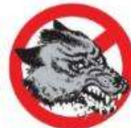
DOGGONE® Wild Dog Bait