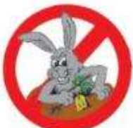
RABBAIT® 1080 Oat Bait