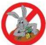
RABBAIT® Pindone Oat Bait