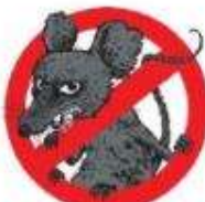
RATTOFF® Rat Bait