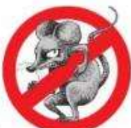
MOUSEOFF® Zinc Phosphide Bait