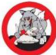
DENCOFUME® Fumigation Cartridges