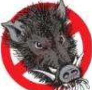
PIGOUT® Feral Pig Bait