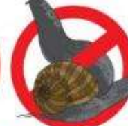
SLUGGOFF® Slug & Snail Bait

Copyright ©2018 Animal Control Technologies, All rights reserved. You are subscribed to the mailing list for Animal Control Technologies