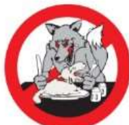
FOXOFF® Fox Bait