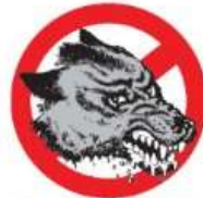
DOGGONE® Wild Dog Bait