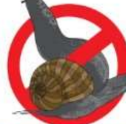
SLUGGOFF® Slug & Snail Bait

Copyright ©2018 Animal Control Technologies, All rights reserved. You are subscribed to the mailing list for Animal Control Technologies