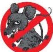
RATTOFF® Rat Bait