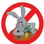
RABBAIT® Pindone Oat Bait