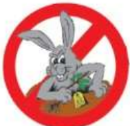
RABBAIT® 1080 Oat Bait