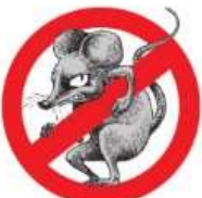
MOUSEOFF® Zinc Phosphide Bait