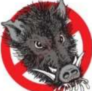
PIGOUT® Feral Pig Bait