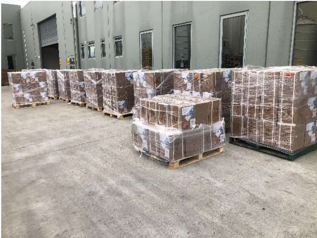
Third of four air freight consignment of zinc phosphide to continue mouse bait supplies at ACTA plant yesterday.

As in 2011, we have absorbed the additional freight cost on the basis of no customers cancelling advance orders. We requested the Federal Government for freight assistance. They recognized the importance of maintaining supply and offered assistance through their IFAM program, however the complexity of the supply chain meant we could not leverage this support.