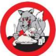
DENCOFUME® Fumigation Cartridges